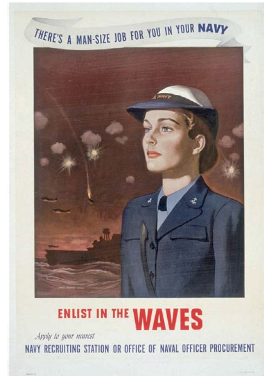
FIG. 5. Recruitment poster for the WAVES, 1940s.

While the era around World War I in the United States inaugurated important shifts in the role of women in modern public life, World War II saw a fully state-led rescripting of women’s possible identities in line with the figure of the soldier-citizen. During World War II, with many young men away at the front, the military establishment turned to women to fill jobs as engineers, doctors, attorneys, cryptographers, and clerical workers—and also to serve as military officers. In 1942 the U.S. Navy founded Women Accepted for Volunteer Emergency Service (WAVES), placing women into shoreside naval jobs so men in these positions might be sent to sea.