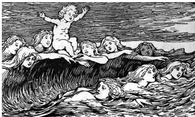
FIG. 2. W. G. Collingwood, Heimdall and His Nine Mothers . Woodcut, 1908.

Waves here offer a durable deliquescence—one supported by a whiteness that may also animate a racialized femininity. Compare this to Hortense Spillers on one oceanic trajectory for the making of blackness, in which “African persons in the ‘Middle Passage’ were literally suspended in the ‘oceanic,’ captured in an “undifferentiated identity” that made of them “ungendered flesh” (1987, 72, 68). For audiences at the turn of the twentieth century, the whiteness of wave women may have gone hand in glove with their anthropomorphization.