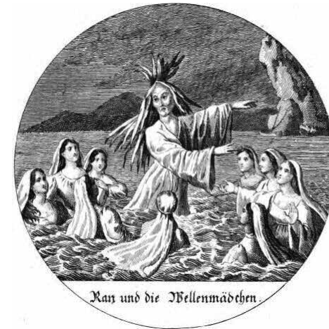
FIG. 1. Rán and the Wave Girls, 1831, from Alkuna: Nordische und nordslawische Mythologie .