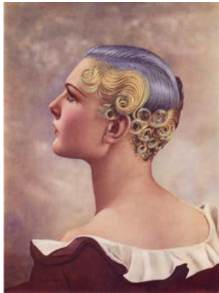
FIG. 4. “First Prize won at the Hairdressing Fashion Show London, 1935, using an Icall permanent-waving machine.” An ocean wave is evoked by a portion of the hair, on top, that was colored blue.

women never gained acceptance in the 1920s, at least among the men and women who publicly expressed their opinions” (Soland 2000, 38). Commentators worried that short hair risked blurring the differences between the sexes, masculinizing women, who were disparaged as “boyish.” But in the late 1920s, a new technology emerged to offer “feminine and graceful styles with curls and waves” to short hair (quoted in Soland 2000, 38). The “permanent wave,” delivering “new curlier versions of bobbed hair . . . marked the reestablishment of gender distinctions in fashionable self-presentation” (Soland 2000, 40). Wavy short hair refeminized white women. A 1926 joke in a farmer’s magazine quipped, “The ocean must be feminine. Anyway, it early adopted the permanent wave” ( Northwest Poultry Journal 1926, 34). 5